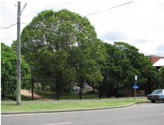
Plate 7 Fig trees at Guthrie Street, Paddington