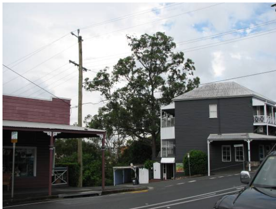
Plate 3 Eucalyptus sp. at 9 Latrobe Tce, Paddington