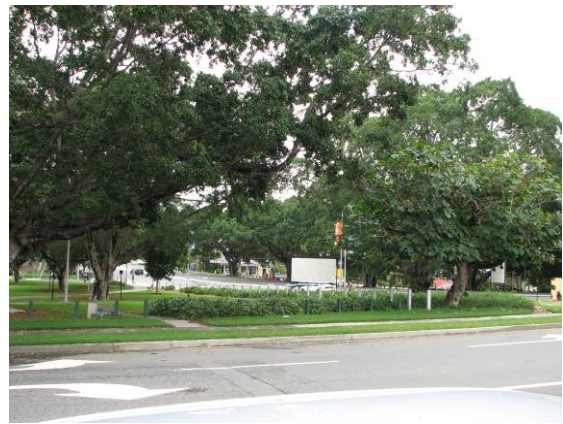
Plate 10 Fig trees at Blamey Street precinct