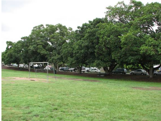
Plate 1 Line of Figs, Gregory Park, Paddington