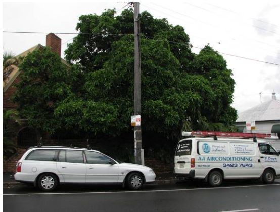
Plate 2 Mango tree at 25 Latrobe Tce, Paddington