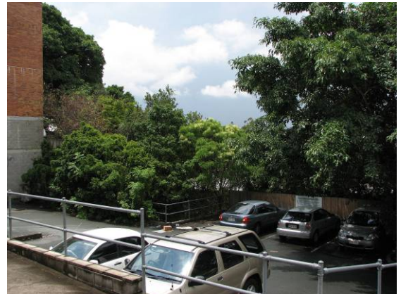
Plate 5 Macadamia, Fig and Doughwood at 251 & 257 Given Tce, Paddington