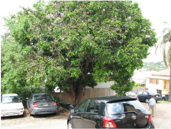
Plate 6 Jacaranda, Silky Oak at Martha Street and Bowler Street, Paddington