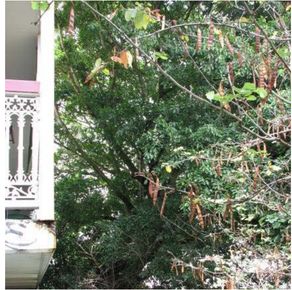
Plate 4 Curtain Fig at 267 Given Tce, Paddington