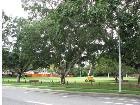
Plate 9 Weeping Fig at Blamey Street precinct