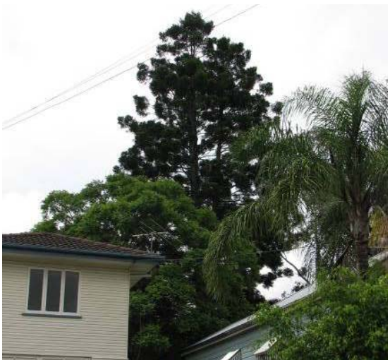
Plate 8 Hoop Pine at 25 Hall Street, Paddington