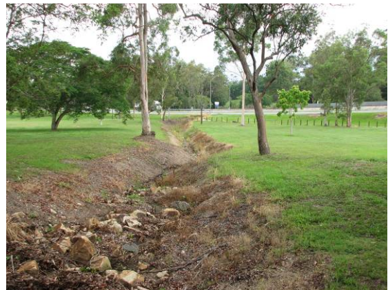
Plate 11 Waterway exiting Botanic Gardens (looking south towards freeway)